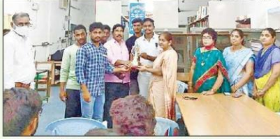
విజేతలను అభినందిస్తున్న అధ్యాపక బృందం

కూచిపూడి, న్యూస్టుడే: మైలవరంలోని లక్కిరెడ్డి హానిమిరెడ్డి ప్రభుత్వ డిగ్రీ కళాశాలలో ఇటీవల నిర్వహించిన క్రీడా వర్షాది ఇంటర్ కాలేజి యేట్ జూనియర్ టెనీస్ పోటీల్లో మొదటి విజయం